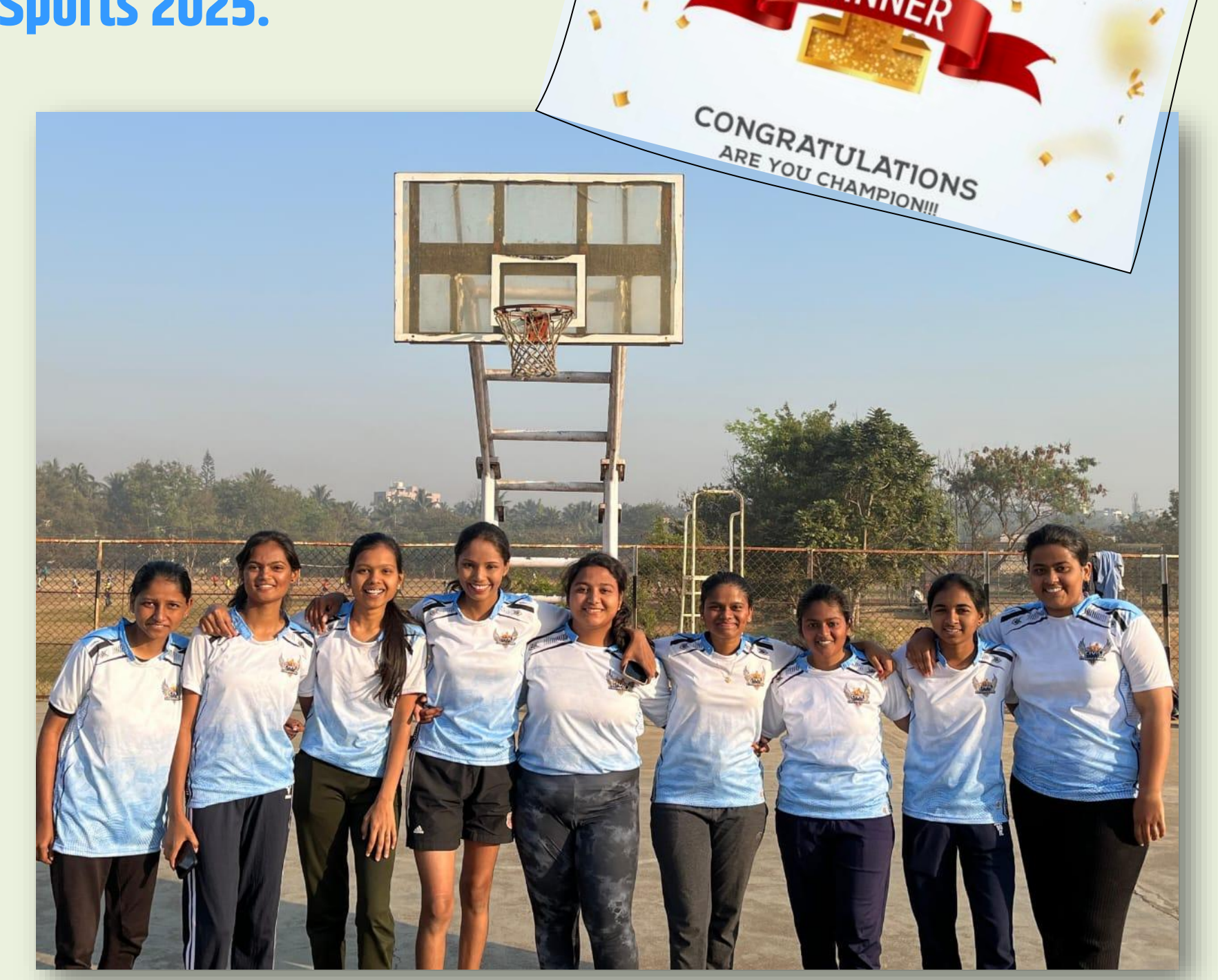
CIVIL GIRLS — Basketball Team

Congratulations to the Civil Engineering Girls' Basketball team for clinching the championship at Annual Sports 2025 with skill, teamwork, and unwavering spirit!